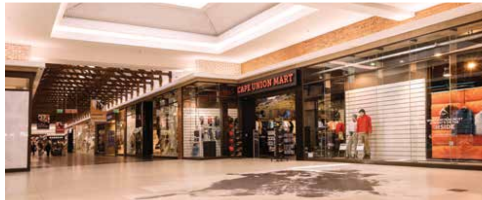
CAPE UNION MART COURT