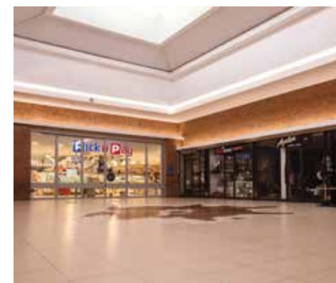
PICK N PAY COURT